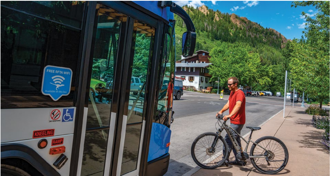
FLYER (FL) ROUTE SUMMER 2026 • JUNE 1 - SEPTEMBER 20

Arrivals in bold are scheduled timepoints, all other arrivals (non-bold) are estimated timepoints. Buses may depart early after passengers exit, depending on traffic. Please arrive early when boarding at this location. Las llegadas en negrita son puntos de tiempo programados, todas las demás llegadas (que no están en negrita) son puntos de tiempo estimados. Los autobuses pueden salir temprano después de la salida de los pasajeros, dependiendo del tráfico. Llegue temprano al abordar en este lugar.