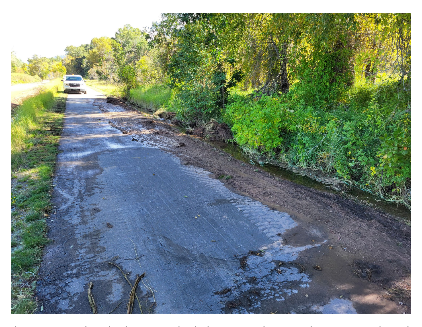
Photo – Home Supply Ditch tail water caused multiple issues over the summer; here you can see the result of Eagle County Road and Bridge trying to "help"