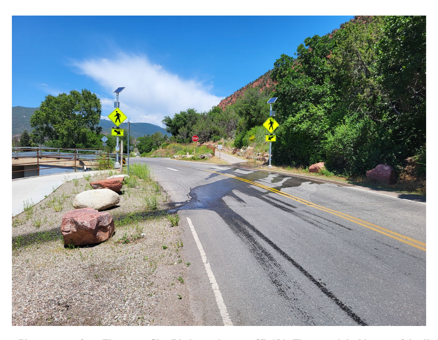
Photo – water from Thompson Glen Ditch running over CR 154. The water is leaking out of the ditch, goes under the RGT and then down to CR 154

• Category (9) Other at MM 5.5 (MP 365.8) - The Thompson Glen Ditch Company has been on my report previously because of their ditch spoils and also because the ditch has been leaking water for years. This year is no different, I found several locations water adjacent to the Rio Grande Trail. See 3 photos below.