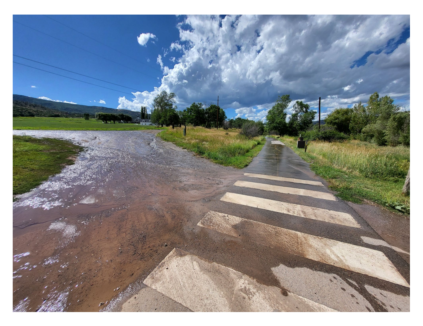
Photo – water flooding and running down RGT, this happened multiple times over the summer. RGT Staff had to clean up/sweep the RGT multiple times as a result.

• Category (9) Other – Ditch issues (tail water flooding) – The Home Supply Ditch is wreaking havoc on RFTA's property. Multiple issues were observed this summer