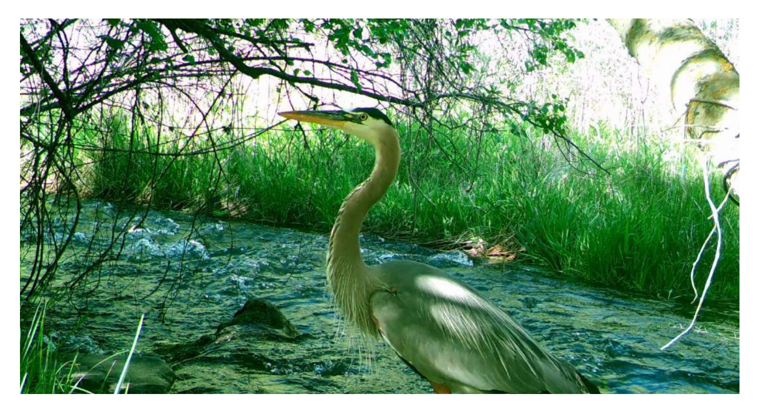
Why So Blue Heron?