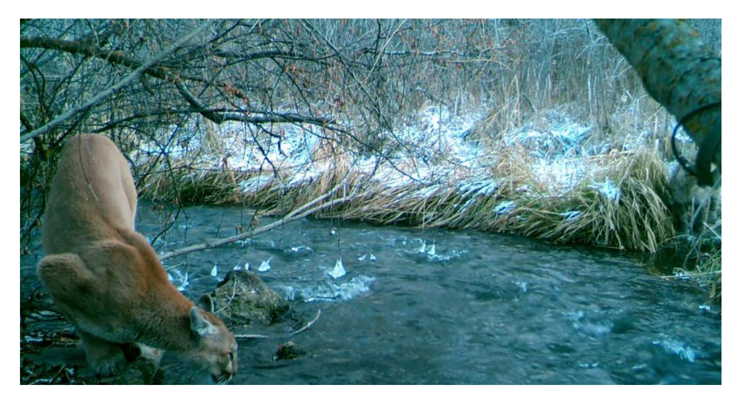
Water Always Tastes Better on the Other Side of the Stream