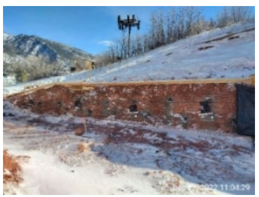
South wall construction

Phase 6 (Transit Center and Operations Center)