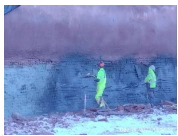
South wall construction