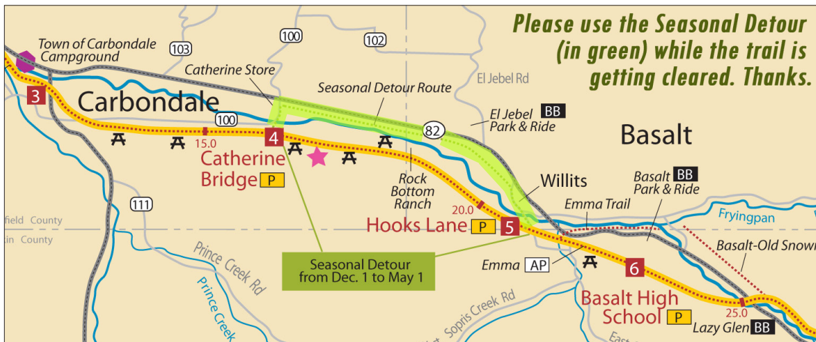
Map of Detour.

We anticipate completion of the trail clean up for Labor Day Weekend. If you need more detailed information please contact our Trail Manager at 970-384-4975.